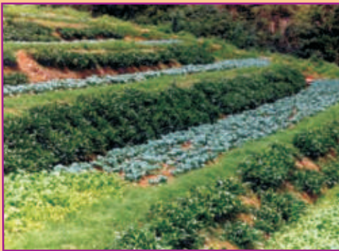
Technique for Establishment of Tea on Terrace Risers in the Nilgiris