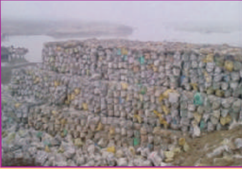
Katta-Crate Technology: A Cost Effective Measure for Rehabilitation of Torrents and Minespoil Areas